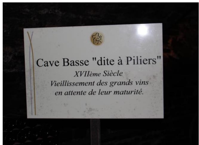
The Patriarche cellars belong to the most fascinating ones in whole Burgundy.

Beautiful red fruit, animalic tones, very fresh entry, crisp, mineral finish. Very nice. 18.5/20 (95/100).